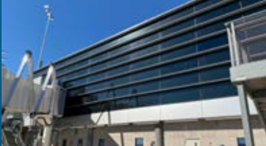
10. ELECTROCHROMIC GLAZED WINDOWS