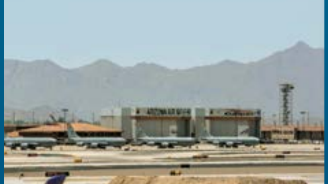
8. AIR NATIONAL GUARD