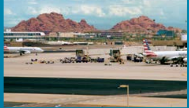
5. BUTTES AT PAPAGO PARK