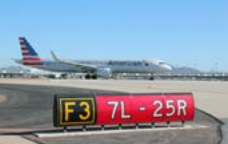
11. SOUTH AIRFIELD