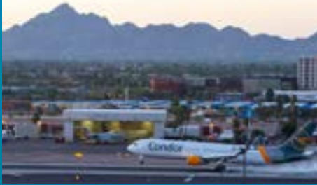
3. PIESTEWA PEAK