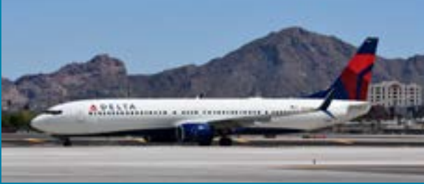
4. CAMELBACK MOUNTAIN