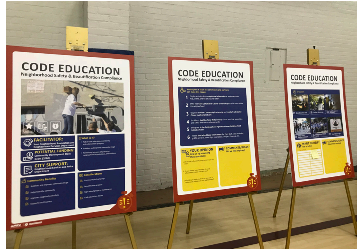
Station #2: Code Education