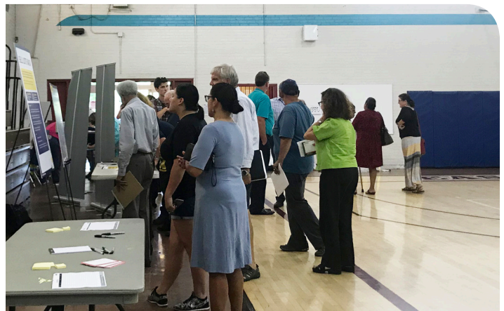
A casual and informative open house format.