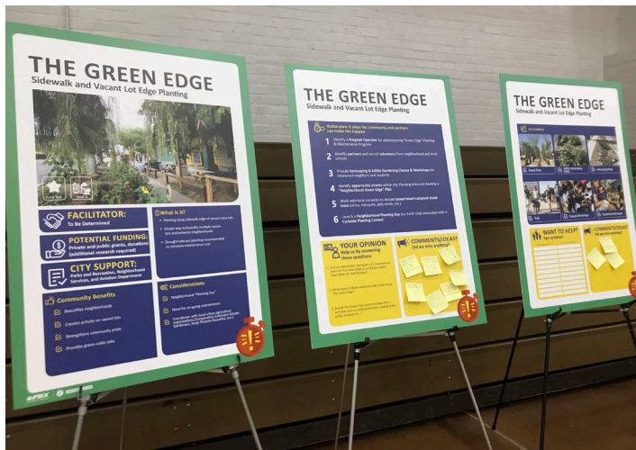
Station #5: The Green Edge