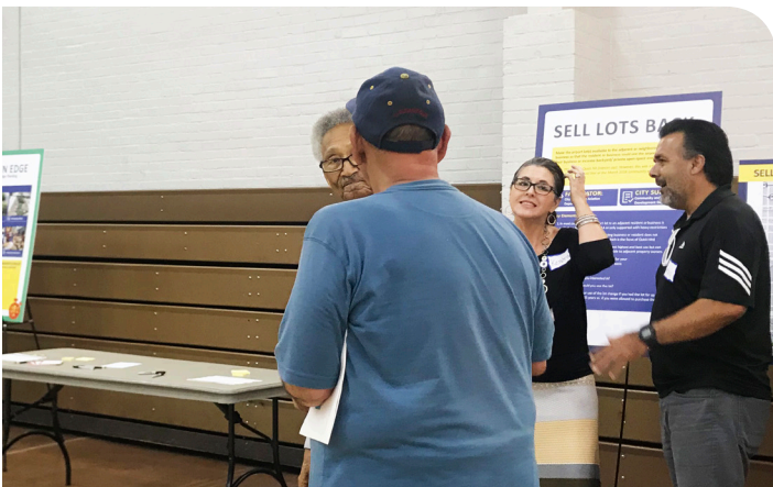
Informal meet and greet before the official event kick-off.