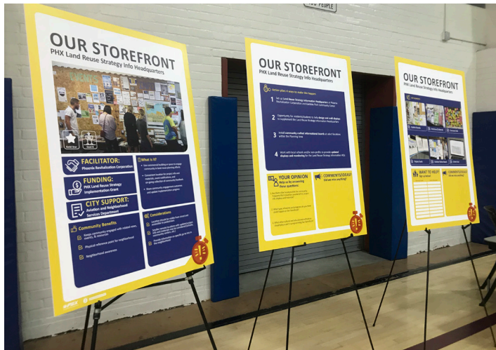
Station #3: Our Storefront