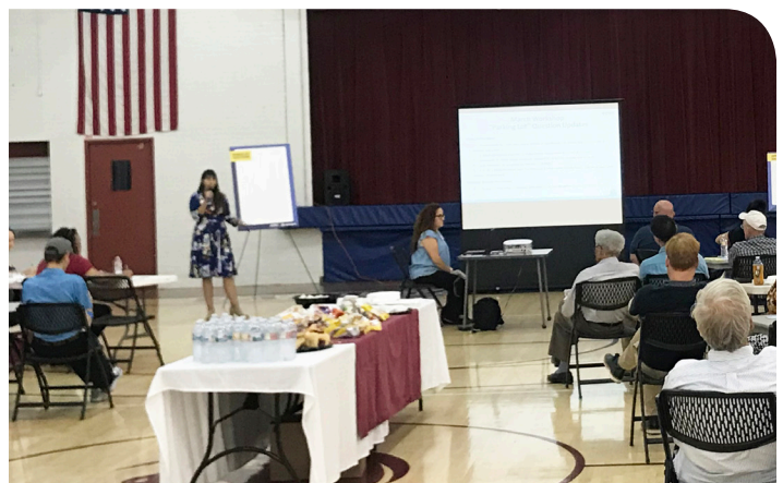
An update on the “Parking Lot” from PRC.