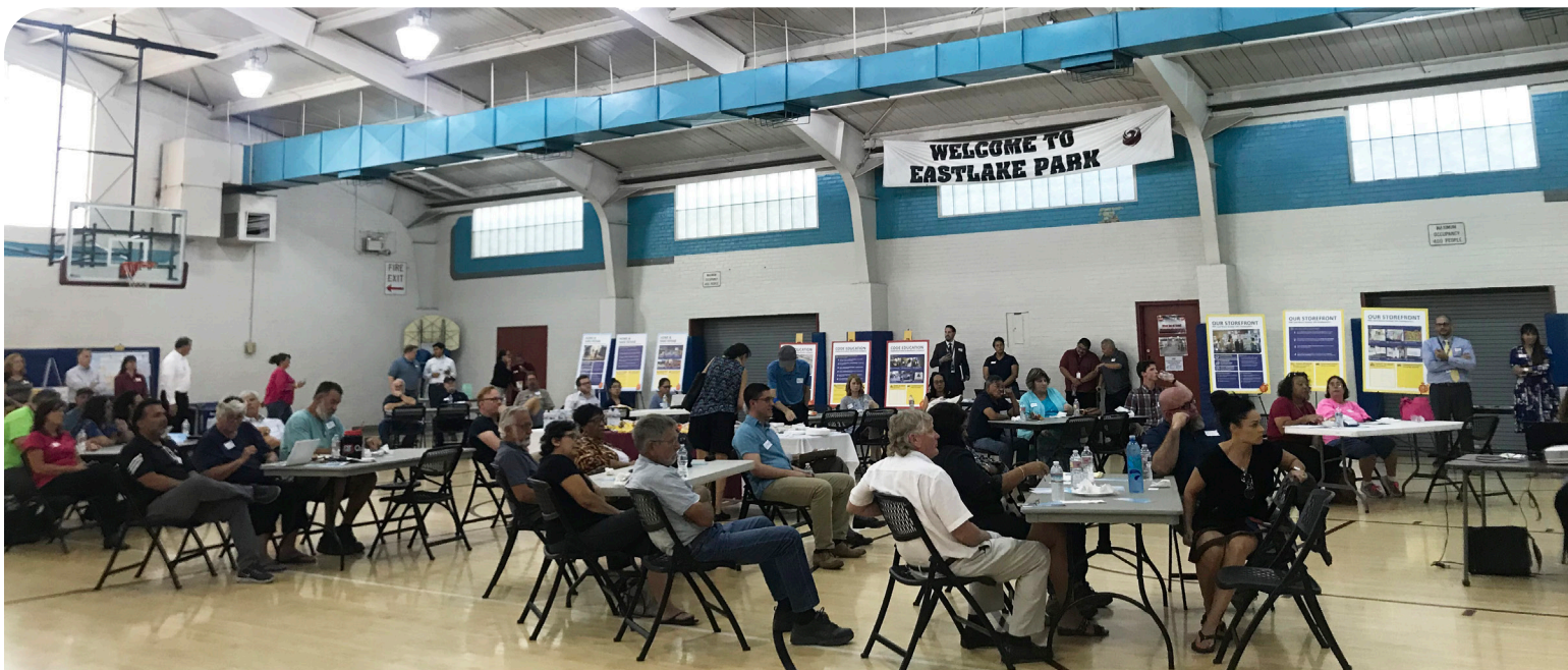
59 participants attended the meeting that evening.