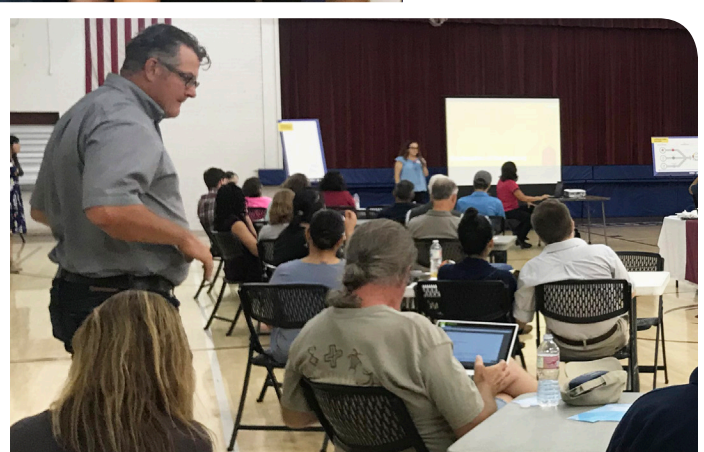
Attendees participated in a Quick Hits online survey.