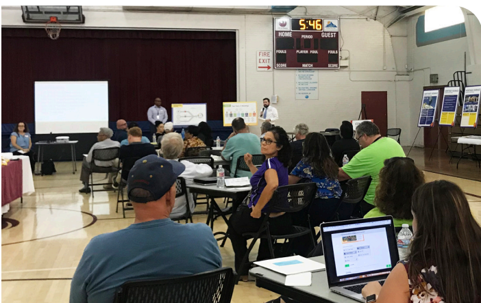
City staff welcomed the public to the open house.