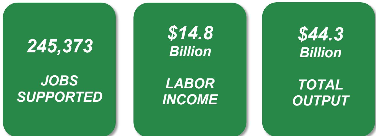
Figure 1 Total Economic Impact of the Phoenix Airport System: 2022

The Phoenix Airport System created a total economic impact of $44.3 billion in 2022. The economic activity generated by system airports supported 245,373 jobs in the regional economy, with income to labor and proprietors of $14.8 billion (Figure 1).