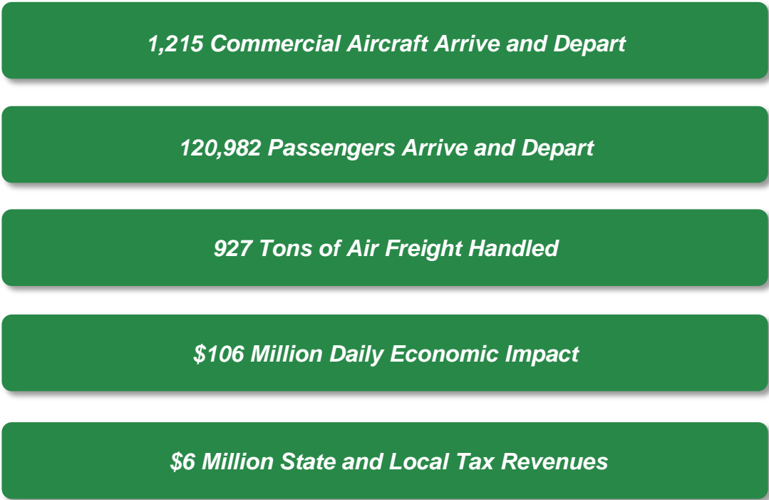
FIGURE 2 AN AVERAGE DAY FOR THE PHOENIX AIRPORT SYSTEM: FY 2016

In 2016, there were more than 440,000 commercial aircraft operations at PHX, resulting in a daily average of 1,215 aircraft arriving and departing. On an average day, 120,982 passengers moved through the terminals and 927 tons of cargo were shipped or received. The daily impact of $106 million is an increase of 34% from 2011.