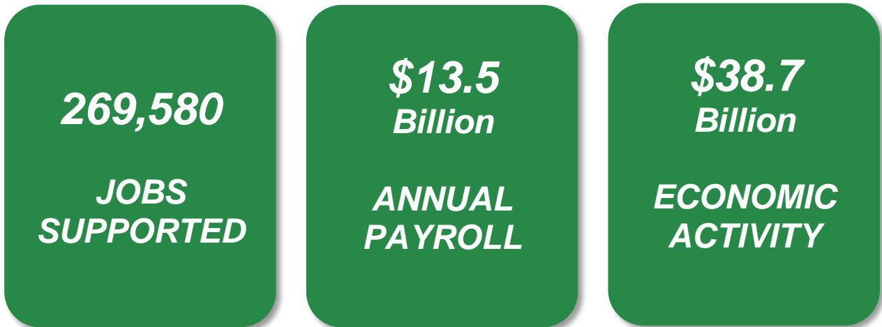
FIGURE 1 TOTAL ECONOMIC IMPACT OF THE PHOENIX AIRPORT SYSTEM: FY 2016

The Phoenix Airport System created a total economic impact of $38.7 billion in fiscal year 2016. The economic activity generated by system airports supported 269,580 jobs in the regional economy, with a payroll of $13.5 billion (Figure 1).